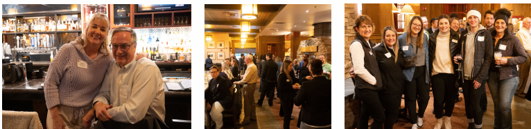
Happy Hour Sponsors

Thank you to everyone who joined us for our March Happy Hour. It was a great night catching up with old friends and forming new relationships. Thank you to Perkiomen Valley Printing for providing the door prize for this event.